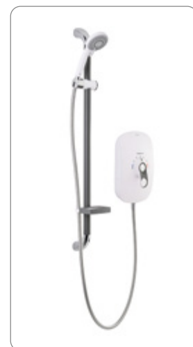
Optional riser rail: Mid Grey