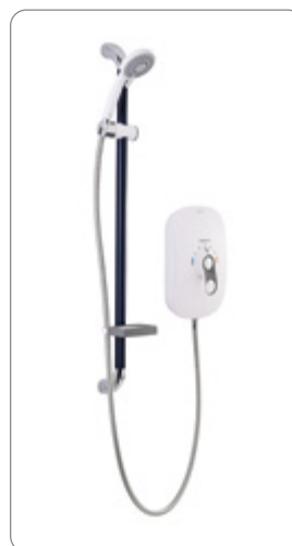
Optional riser rail: Dark Blue