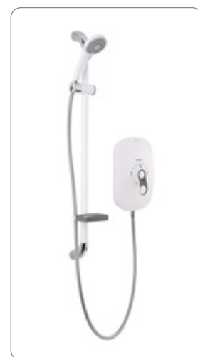
Care Accessory Kit