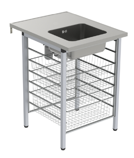
Washing bench 328

The top should be screwed to the wall through the holes in the rear of the top plastic.