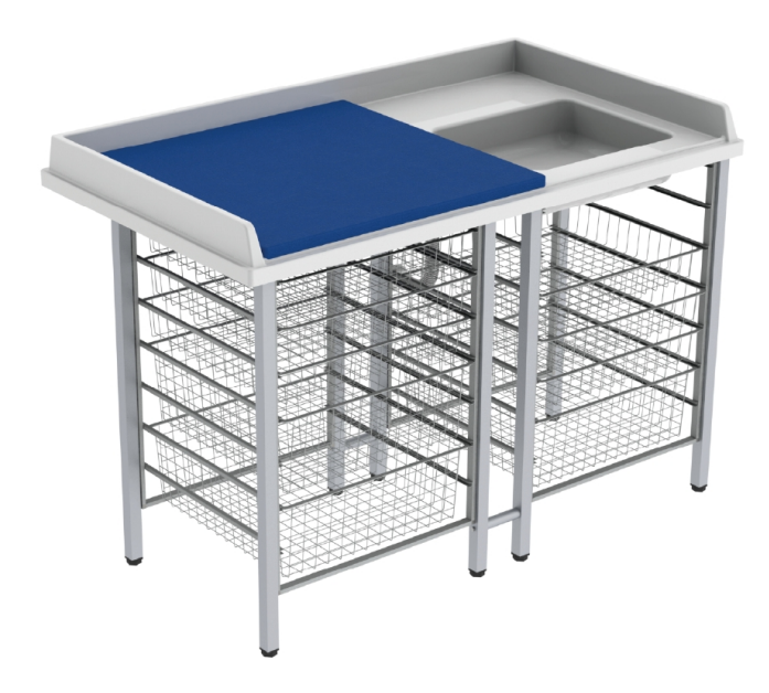
Baby changing table 327

Place the changing table on the selected position. Adjust the feets so that the changing table stands firmly on the floor and that it is level.