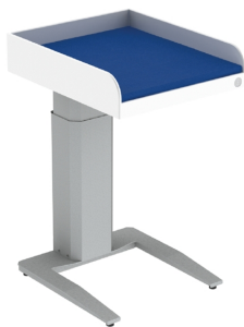
343 - Without bathtub

The changing table is delivered assembled on a pallet.