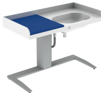
343 - with bathtub