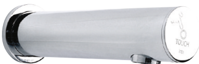
Perfect Time - Wall Mounted