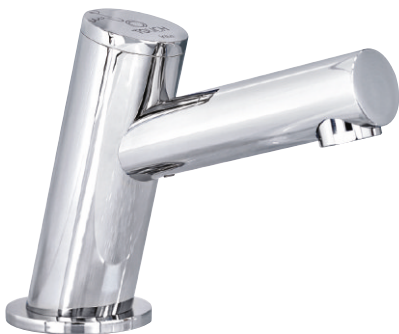
Perfect Time - Deck Mounted

With an 8 second factory preset, installation or maintenance staff can easily change this time manually according to the needs. Running time adjustment is not accessible to the end users.