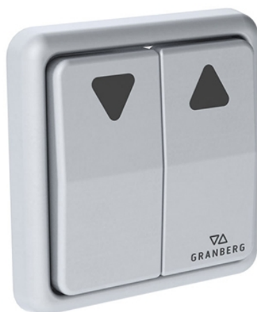
Granberg Corded Control Button in Alu-design Product Code: 61310 - InDiago Wall Cabinet Lift Product Code: 61310 - Verti & Diago Wall Cabinet Lifts