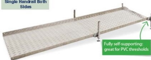
Single Handrail Both Sides

Choice of coloured handrails: Graphite, Garden Green, Heritage Brown and Yellow