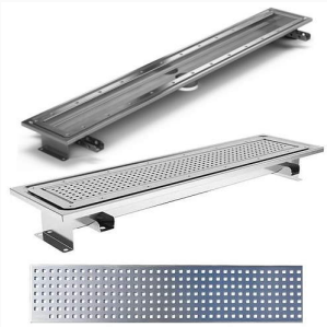
Purus SS Channel Drain 100, Vinyl Floor Chess Grid, Centre Outlet - 1000mm

800mm length Purus 100 stainless steel channel drain with a chess grid, ideal for shower areas, changing rooms, hotels, and leisure facilities with Vinyl sheet flooring. For installation in timber or concrete/screed floors. Heel-safe, suitable for bare-foot areas. Centre outlet with a choice of 3x plastic wastes, horizontal and vertical outlets. Or upgrade to the Acid proof stainless steel vertical 75mm outlet.