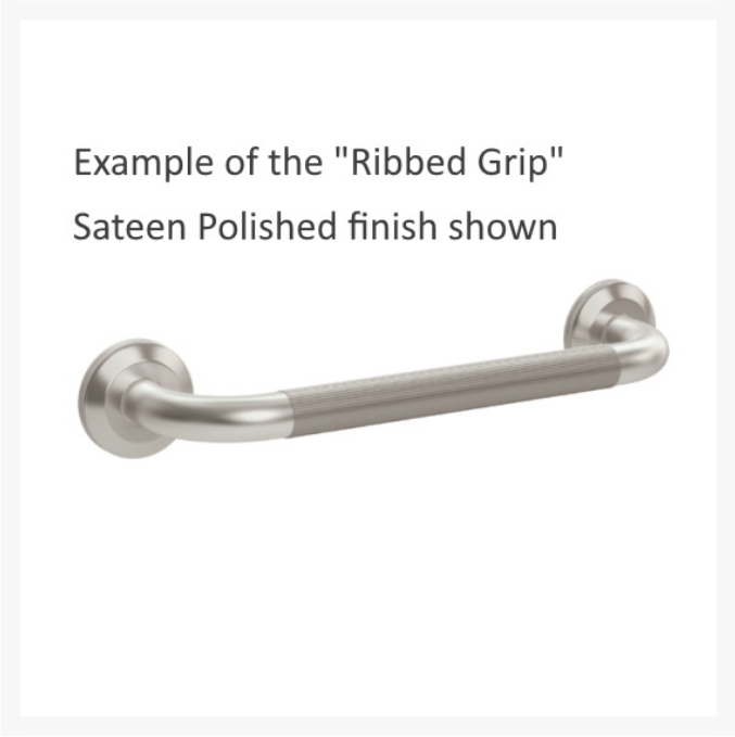
Example of the "Ribbed Grip" Sateen Polished finish shown