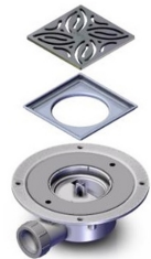
16-006-037 Dry Waste Non Return Valve