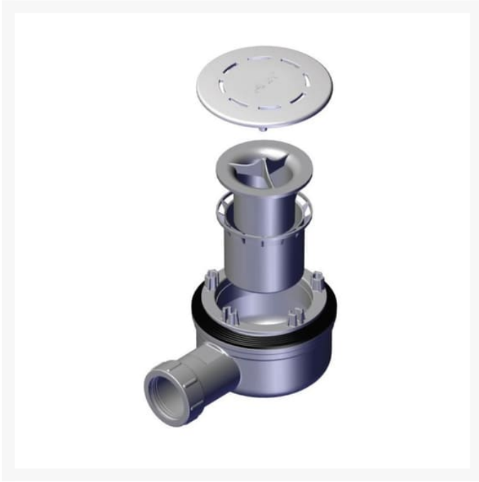
Sulby 3 Tray 1200 x 700mm AKW 25434 GW90 Metal Topped Gravity Waste Product Code: 17300W