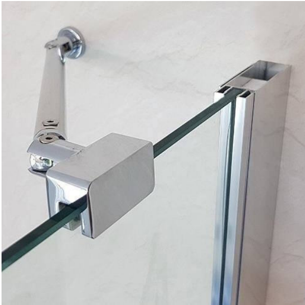
GD52 LH In-line Top Bi-fold Stable Door & Fixed Wall Panel - 1200, Adjustment 1100-1190mm