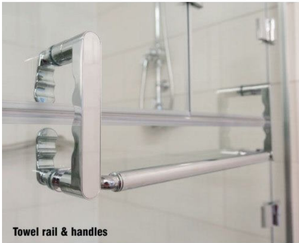
Towel rail & handles