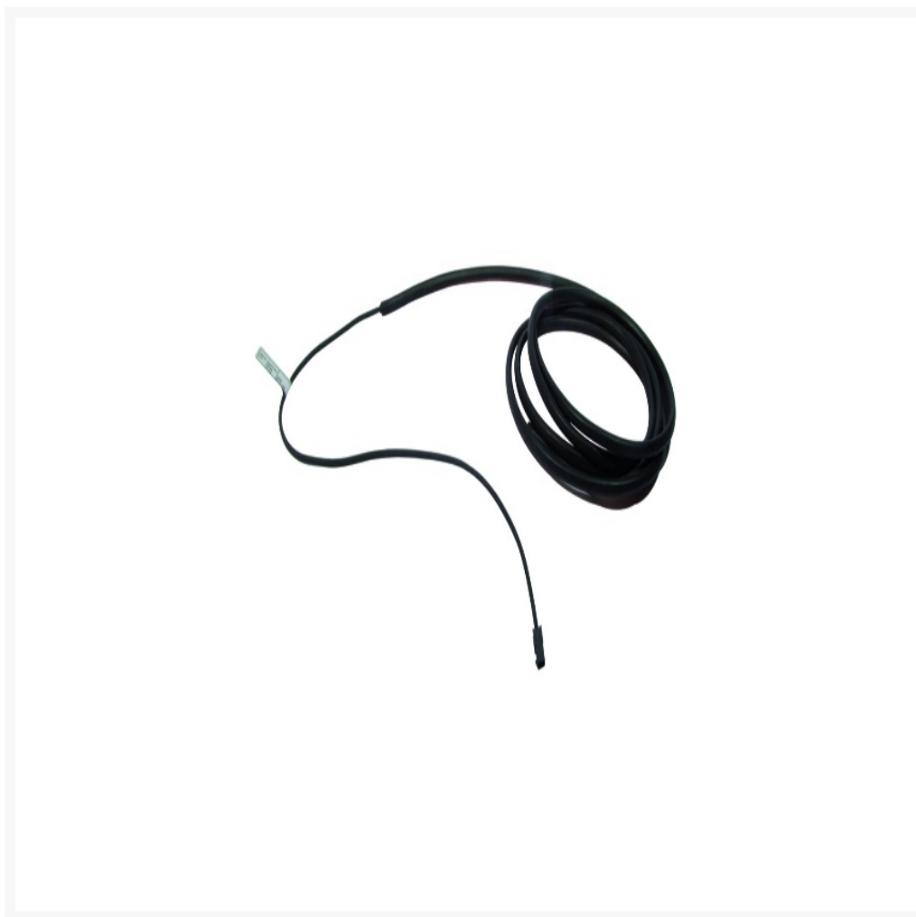
Mounting the safety stop strip - See PDF Installation Instructions