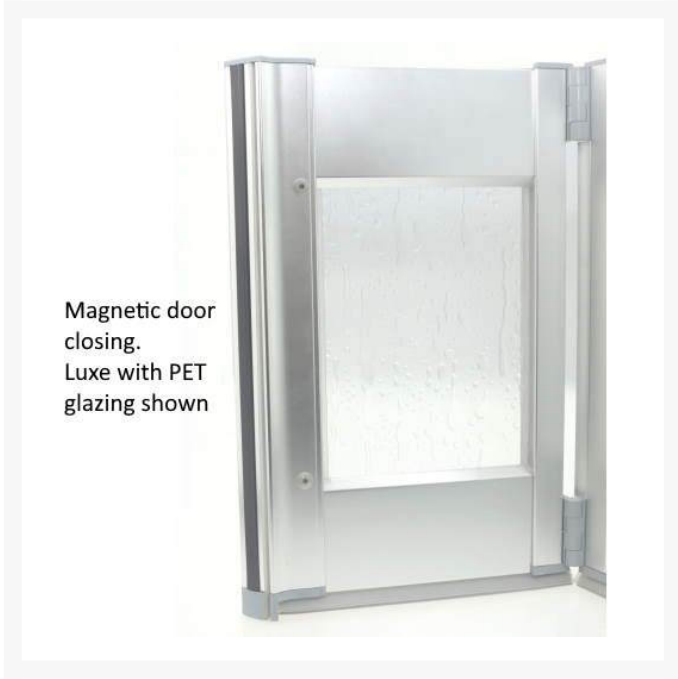
Magnetic door closing. Luxe with PET glazing shown