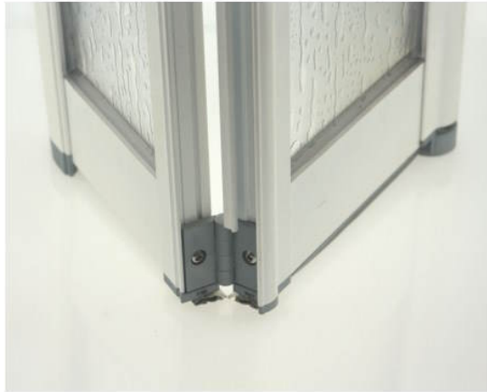
Standard Click hinge (Inward opening door shown)