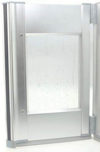
Magnetic door closing. Luxe with PET glazing shown