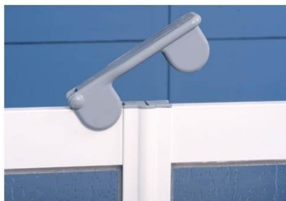
Flip over Light Grey Latch "Shown with White doors / PET Glazing"