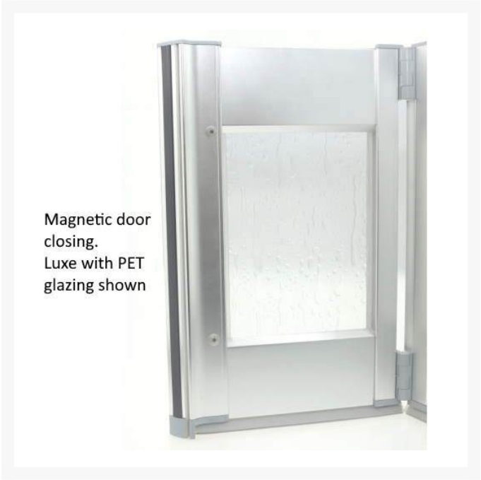
Magnetic door closing. Luxe with PET glazing shown