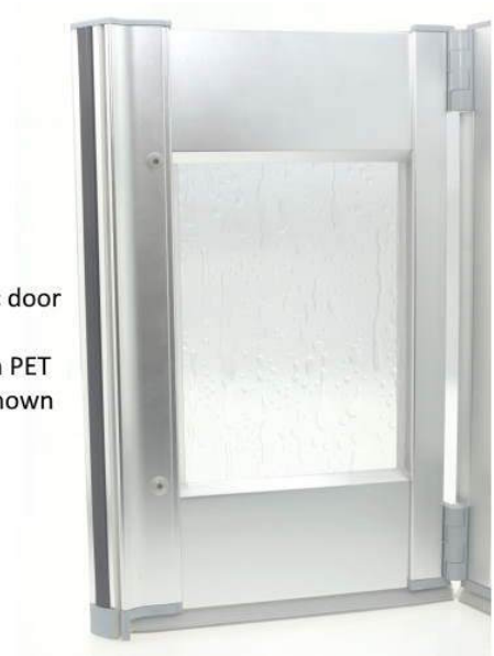
Magnetic door closing. Luxe with PET glazing shown