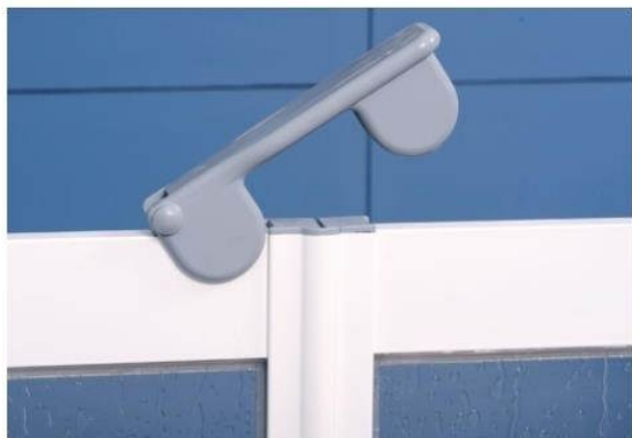
Flip over Light Grey Latch "Shown with White doors / PET Glazing"