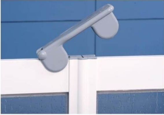
Flip over Light Grey Latch "Shown with White doors / PET Glazing"