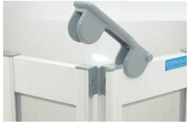
Magnetic door closing. Luxe with PET glazing shown