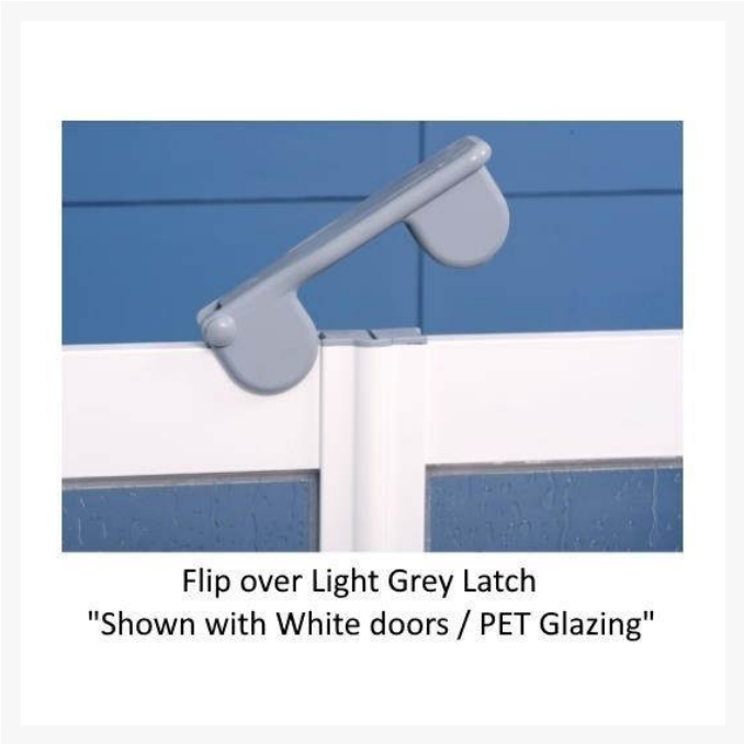
Flip over Light Grey Latch "Shown with White doors / PET Glazing"