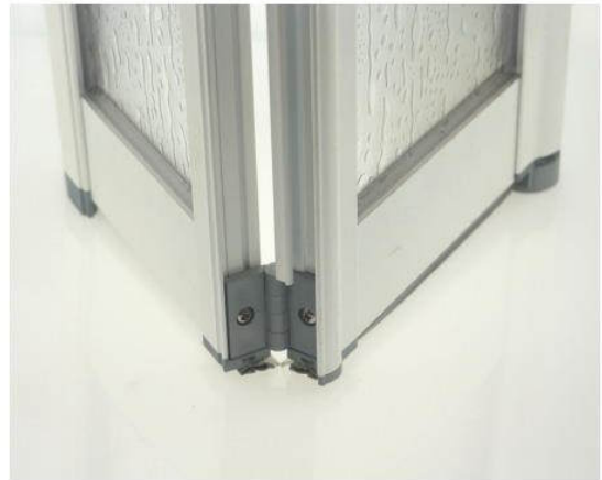
Standard Click hinge (Inward opening door shown) "Note: White doors with PET shown"