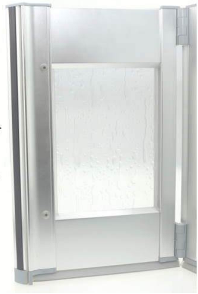
Magnetic door closing. Luxe with PET glazing shown