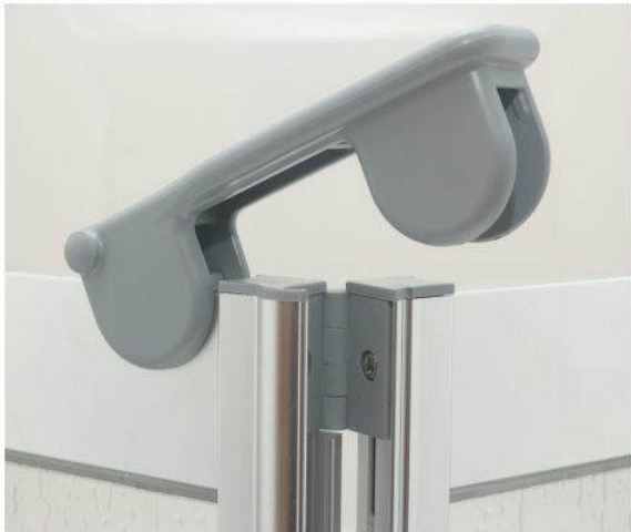
Light Grey door latch, Click fold-in hinge LUXE frame with PET glazing example