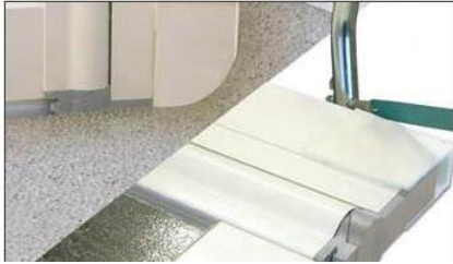
Note - Lower image details: White doors with PET glazing